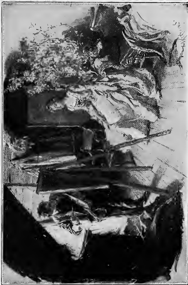
And so the picture was begun.